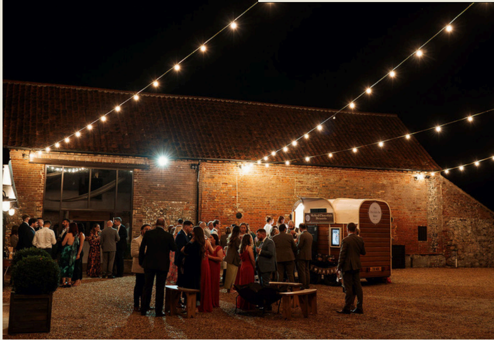
One day hire of Curds Hall Barn.