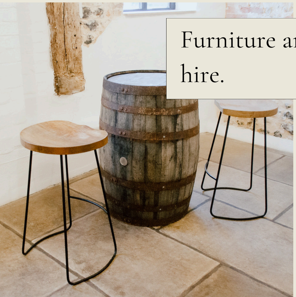
Furniture and prop hire.