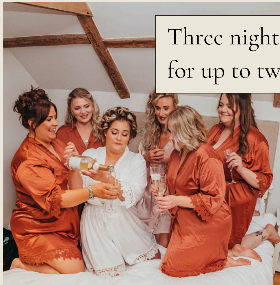
Three night stay on site for up to twelve guests.