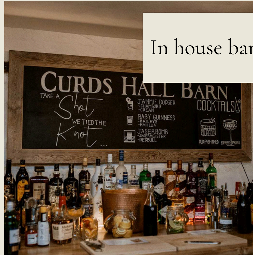
In house bar.