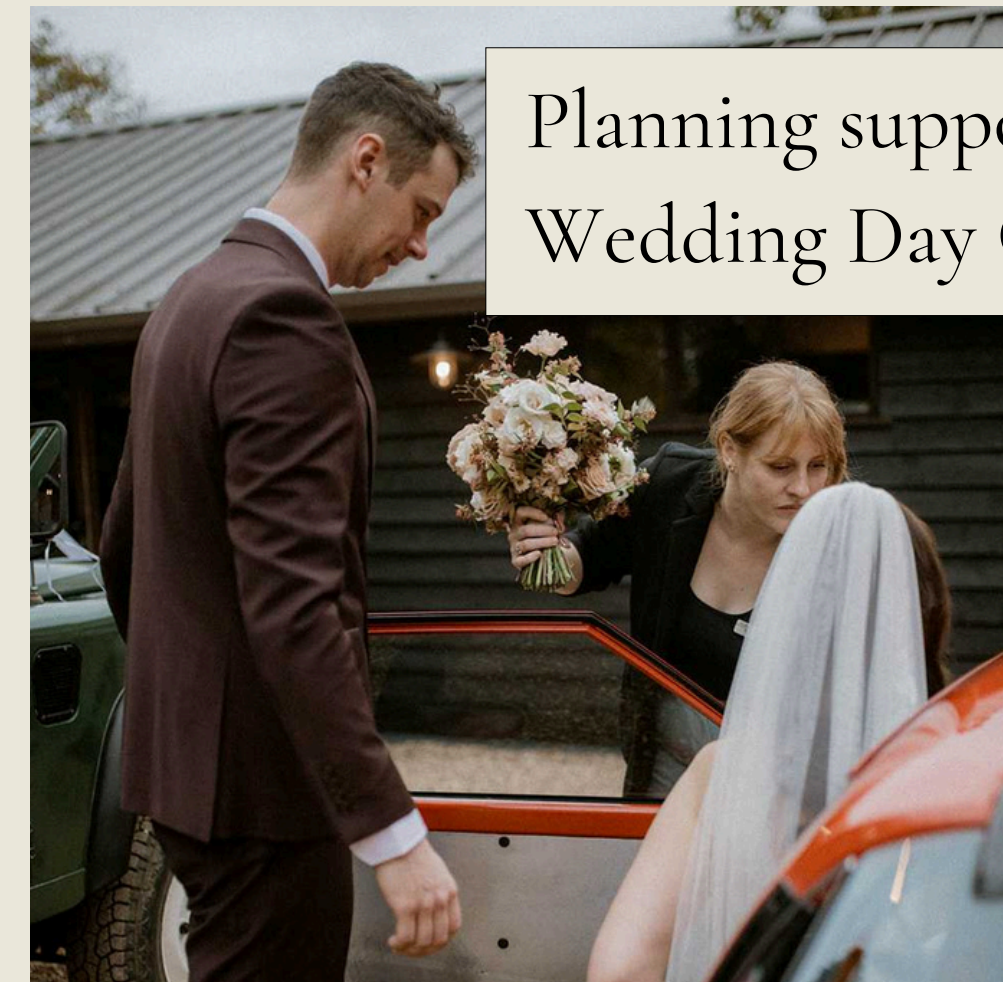
Planning support and Wedding Day Coordinator.