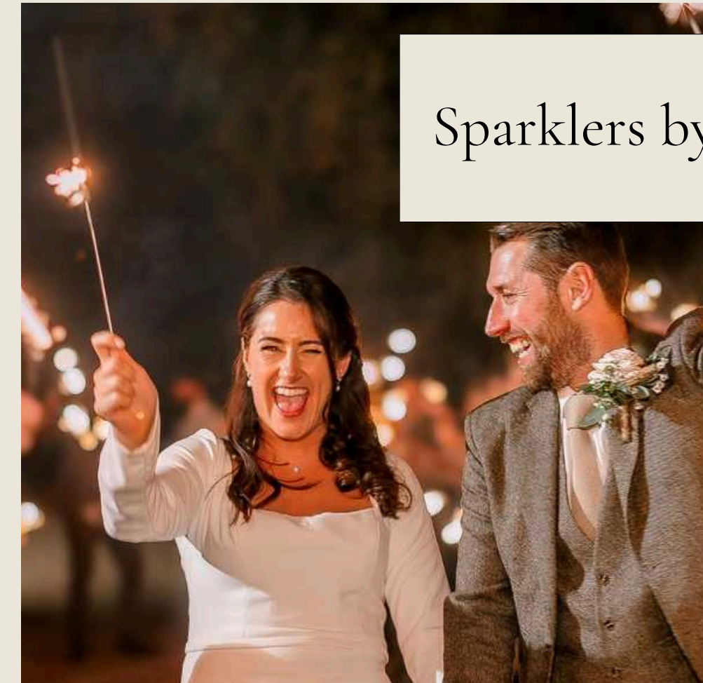
Sparklers by the fire pit.