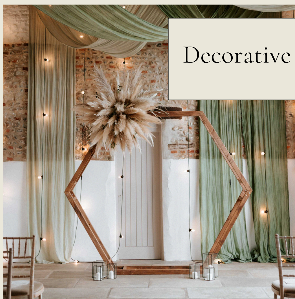
Decorative lighting hire.